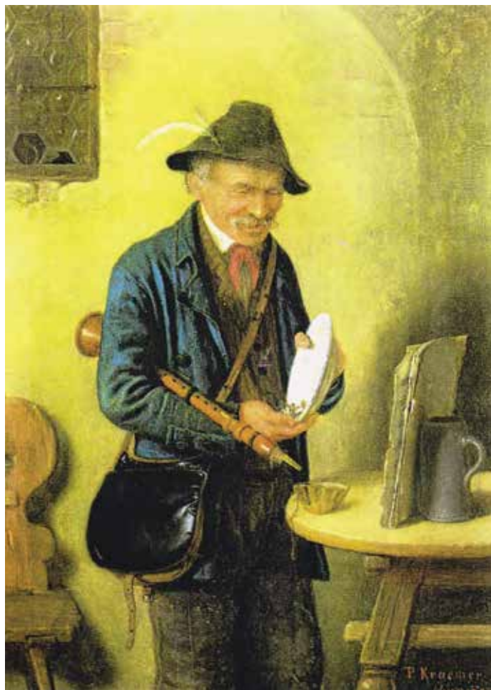
Untitled painting by P. Krämer (late 18 th century); Mödling, private collection.

It is appropriate at this point that we turn our attention to a few primary sources. The first source to consider is the Méthode